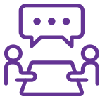
Counseling and Consultations