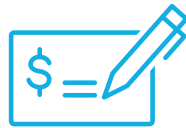
Financial Assistance and Grants