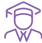
Workshops and Classes