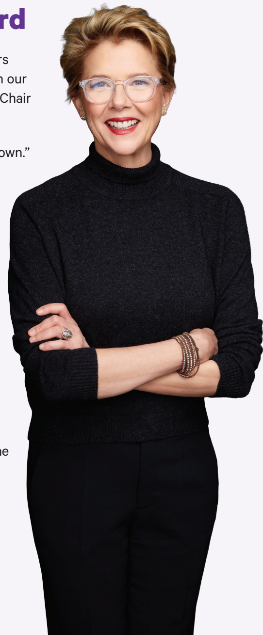
Annette Bening, Chair of the Board