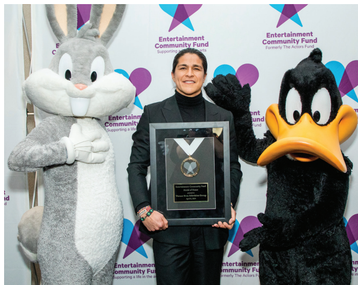
Left to Right: Bugs Bunny, Cristo Fernández and Daffy Duck accept the Medal of Honor on behalf of Warner Bros. Television Group at our Gala.

The global pandemic pushed many entertainment professionals to the very brink. So the Fund made a promise; we recommitted ourselves to serving our community—whenever and wherever help is needed.