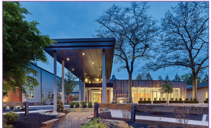
The Actors Fund Home, Englewood, New Jersey