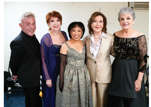
Left to Right: Wayne Cilento, Donna McKechnie, Baayork Lee, Kelly Bishop and Priscilla Lopez.

The Fund currently has two programs responding to the unique needs of dancers: Career Transition For Dancers and The Dancers' Resource. You can learn more about these programs by visiting entertainmentcommunity.org/ctfd and entertainmentcommunity.org/dancersresource .